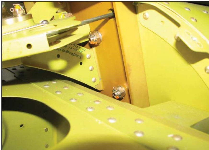
Figure 2 - Outside View of Aftmost Bolts with Tail Cone Removed