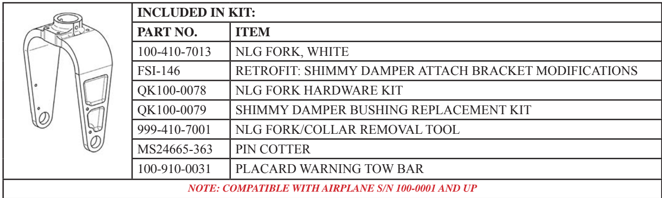
Table 1–3: QK100-0089 Nose Landing Gear Fork 100-410-7013 Upgrade Kit