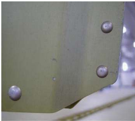
Figure 1: Rudder Trimming

Follow the instructions contained in this Service Bulletin to increase the clearance between the rudder and elevator control surfaces.