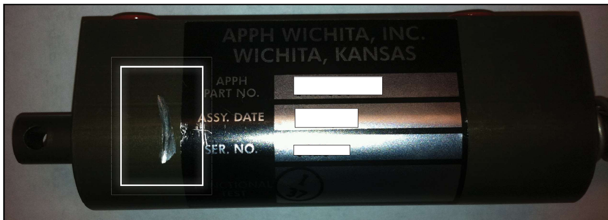
Figure 1-2: Example Damage to Master Brake Cylinder